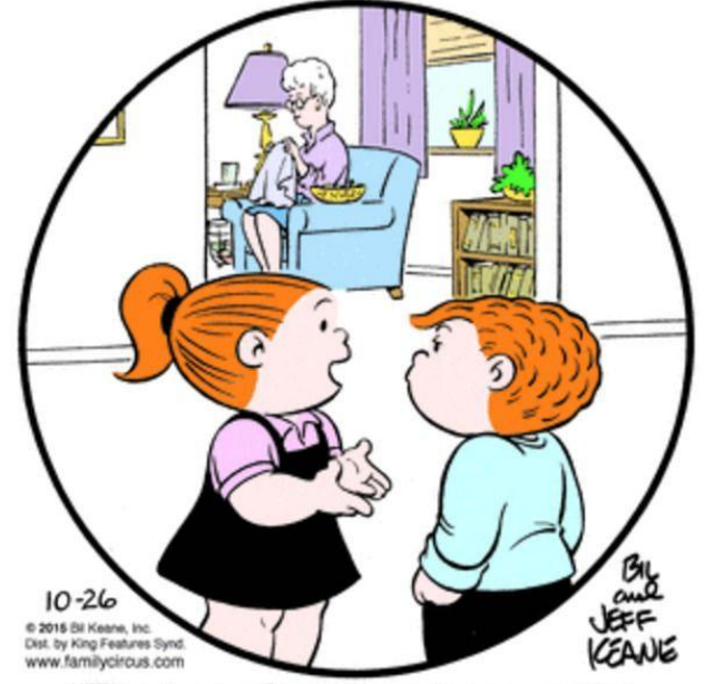
"The two places we know we're always welcome are church and Grandma's house."

from JoyfulNoiseletter.com Reprinted with permission of Bil Keane