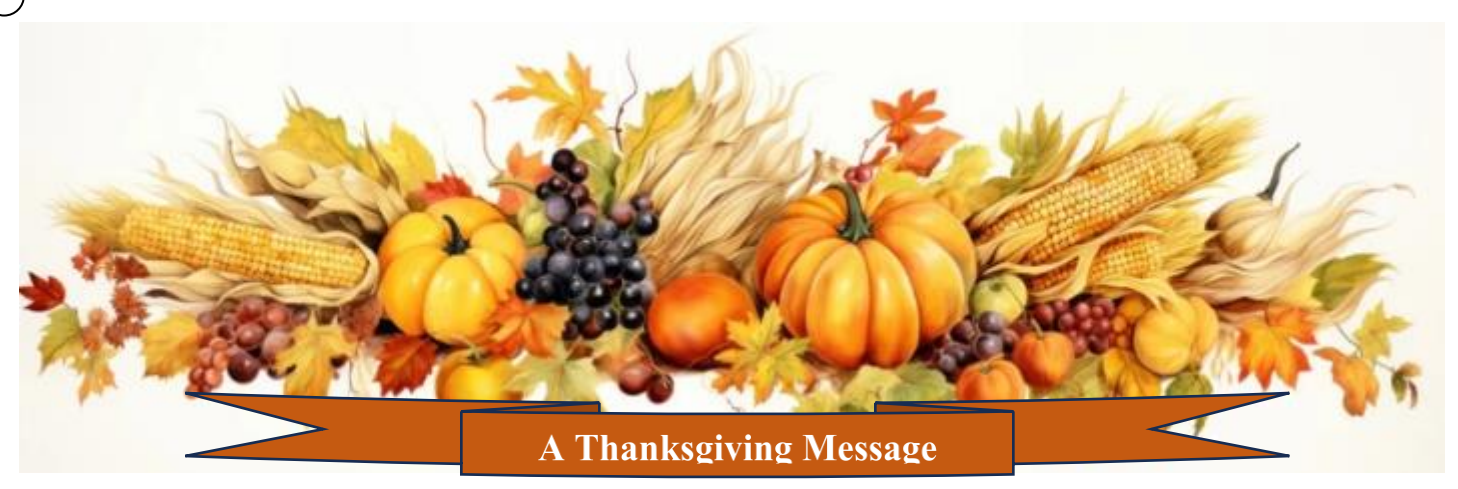
Source: <u>https://thechapel.com/blog/a-thanksqiving-</u> message/#:~:text=This%20Thanksqiving%2C%20I%20encourage%20you,(James%201%3A17a).

Sunday Worship 9:30 a.m. ~ Church School 10:45 a.m